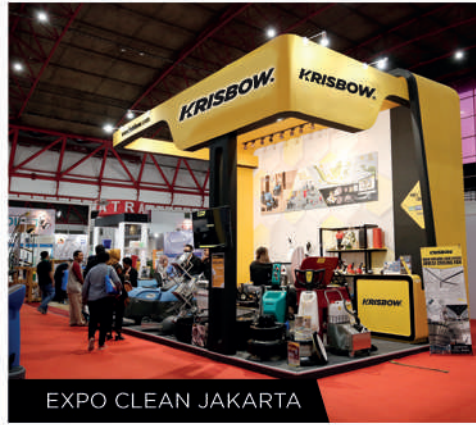
EXPO CLEAN JAKARTA

To fulfill our missions, we actively participate in events & exhibitions to cater customers' needs, provide easy access to global market, and deliver quality services.