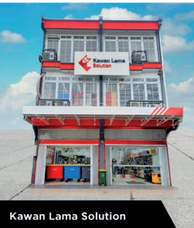
Kawan Lama Solution