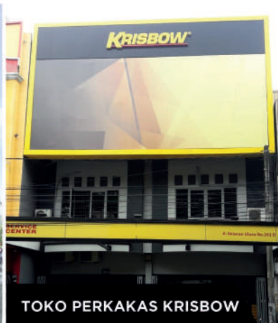
TOKO PERKAKAS KRISBOW