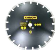
Cutter Asphalt-Concrete 14"