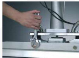
The blade is easily changed within 2 minutes