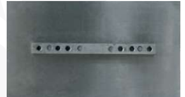
Finishing blade 6x14"