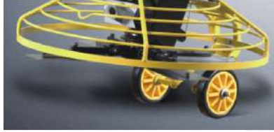
Trowel transport wheel