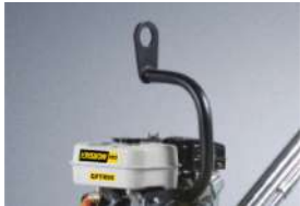
Trowel lifting hook