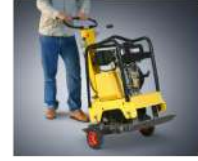
Compactor REV transport wheel