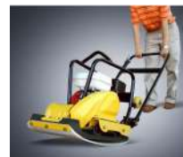
Compactor rubber mat