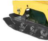
Compactor REV extension plate