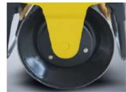
Thick drum shells for longer drum life