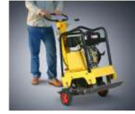
Compactor REV transport wheel