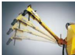
Variable height adjustment for operator's comforts