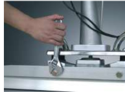
The blade is easily changed within 2 minutes