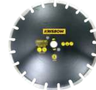
Cutter Asphalt-Concrete 14"