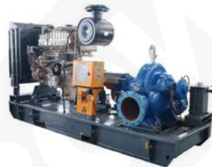
Fixed Water Pump