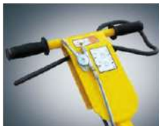
Deadman control and reversing protection