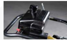
Durable plastic oil tank