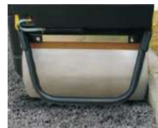
Narrow overhang for operation close to walls and curbs