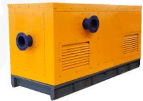
Silent Water Pump