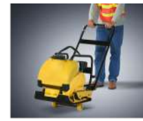
Compactor transport wheel