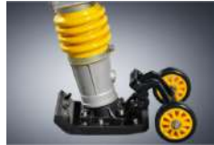
Rammer transport wheel